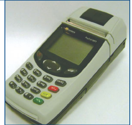
The Thyron PayCell® MPT500 mobile payment terminal: the instant Chip & SIM solution

For restaurant pay-at-table, merchants that require mobility and for most retail outlets, the Chip & SIM system provides card payment transactions anywhere, anytime.